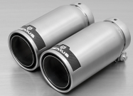
#83C: Stainless steel tail pipes Ø 84 mm Street Race, polished