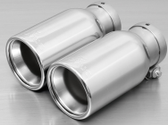
#05: Stainless steel tail pipes Ø 90 mm, chromed