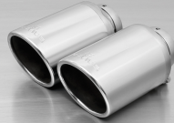
#55S: Stainless steel tail pipes Ø 84 mm angled, chromed