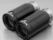
#83CB: Stainless steel tail pipes Ø 84 mm Street Race Black Chrome