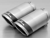
#83CS: Stainless steel tail pipes Ø 84 mm Carbon Race, polished